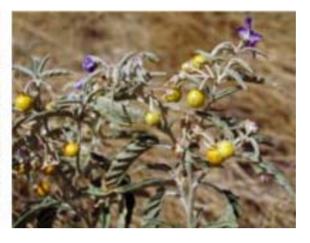
Funding Available : African Boxthorn, African Lovegrass & Silverleaf Nightshade Control

For further information please visit <a href="http://www.coorong.sa.gov.au/pests&weeds">http://www.coorong.sa.gov.au/pests&weeds</a>