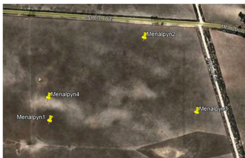
Figure 1. Soil test locations taken from areas of historical high growth (Menalpyn 1) through to areas of historical low growth (Menalpyn 4) as established from historical NDVI Imagery