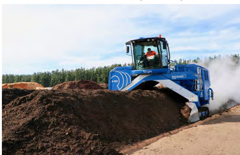
Figure 3. Compost row being turned at Bio Gro Wandilo site with a Windrow Turner.