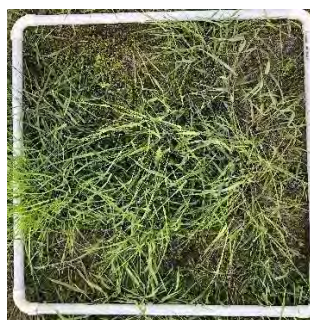
5b. SOA + GA