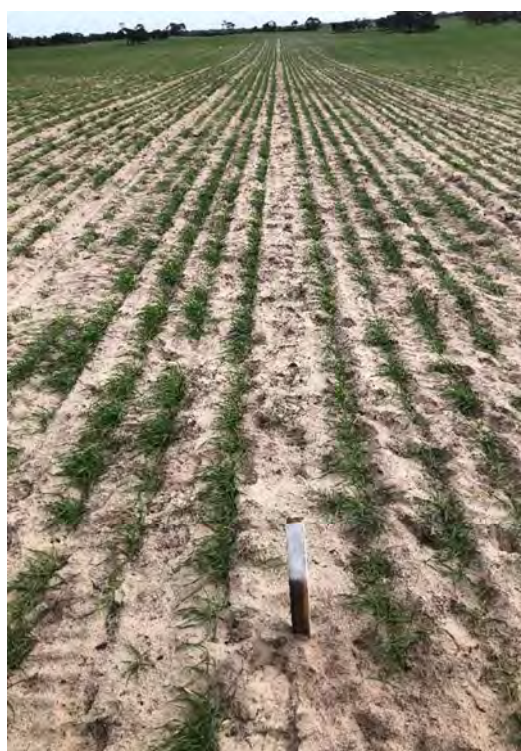
Establishment in non wetting sand at Meningie

The project demonstration sites will be supported by crop walks, workshops and updates to improve knowledge around the physical, chemical and biological constraints of non wetting sands and management options to optimise production and improve soil health in the Coorong and Tatiara regions.