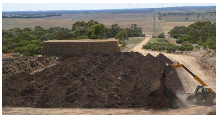
Figure 1. Compost piles being turned to promote microbial activity and stimulating decomposition processes (courtesy Mulbarton Compost).

There are over 1.2 million hectares of sandy soils across the Limestone Coast with low water and nutrient retention capacity, often resulting in poor plant health and soil function. Thankfully, these constraints can be treated with a range of soil management techniques to improve their productivity and resilience. These include practices such as clay spreading and targeted nutrient applications to treat chemical constraints, and deep ripping and soil mixing to treat soil physical constraints. Recent research on sandy soils across the southern cropping zone has explored the use of organic soil amendments such as animal manure, legume hays and compost to improve soil and crop health, generating interest in the broadacre application of these products.