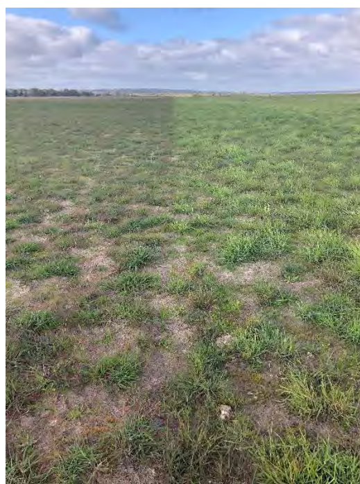
Figure 4. Response to SOA + GA mix. LHS = nil treatment, RHS = treated