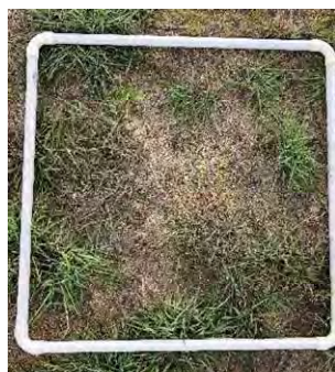
5a. Nil treatment