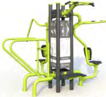
OUTDOOR MACHINE EQUIPMENT, SIMPLE USE, ACCESSIBLE DESIGN