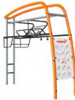
STEEL FRAME POWDER-COAT COLOURS, INSTRUCTIONAL DIAGRAMS