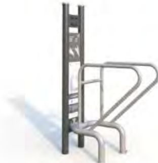
OPTIONAL INDIVIDUAL COMPONENTS