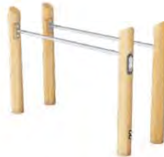
SIMPLISTIC DESIGN FOR A RANGE OF AGES AND CREATIVE ENGAGEMENT