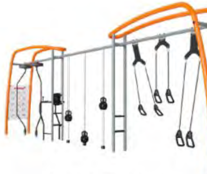
OPTIONS FOR CUSTOMISED EXERCISE PROGRAMS