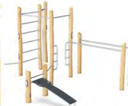
NATURALISTIC MATERIALS, VERSATILITY OF RESISTANCE TRAINING EQUIPMENT