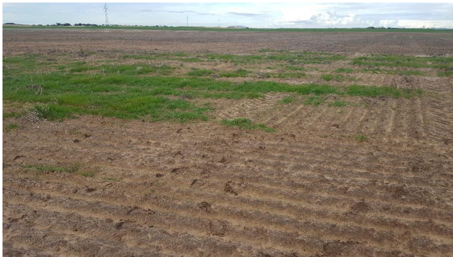
Fig 1. Patchy establishment at Cooke Plains site (28 th June 2017)