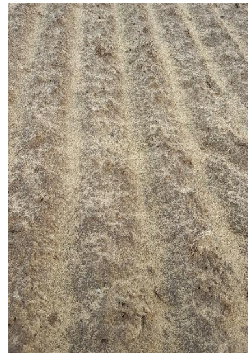
Fig2. Poor/no germination on flats