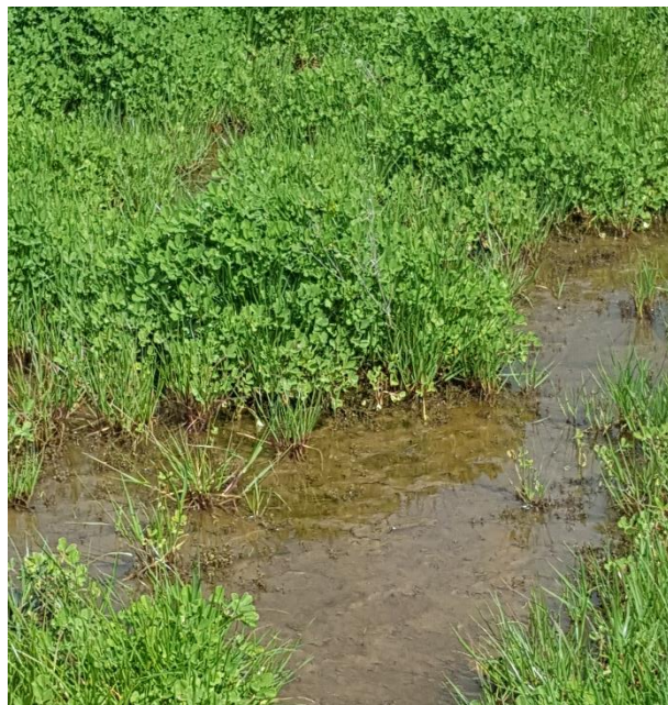
Figure 11. Messina Regeneration in 2017

Since the sites were established, other Messina sites have been identified and are being included in monitoring to add value to the project. These include a site at Neville and Jan White's, Cooke Plains that is being run by Elders Murray Bridge and Heritage Seeds, and also a site at Paul Simmons' where Messina was established in 2016. Fig 11 shows the regeneration of Messina at Paul Simmons' and Fig 12 show the seed sitting on the soil surface in late August.