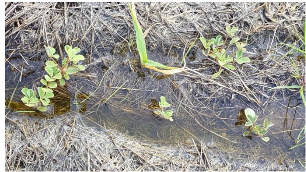
Figure 9. Messina growing while inundated.

The Messina had established initially in areas that then became inundated with water, and it appears to be tolerating temporary inundation at this site (Fig 9 – 10).