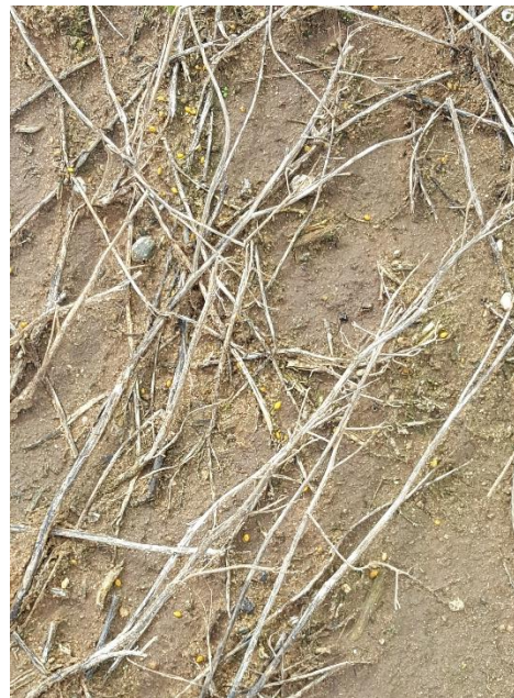
Figure 12. Messina seed sitting on the soil surface

The site at White's contains various legumes and grass species that have been planted around a saline swamp to see how each species performs. As part of the project, feed tests have been taken comparing Messina feed quality to that of Scimitar Medic, Balansa and Nitro Persian Clover. The initial results are shown in Table 2.