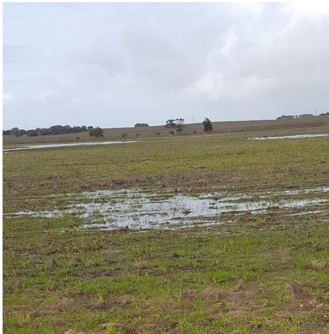
Figure 8. Meningie East site 14 th September 2017

Initial plant establishment of the Messina (6 weeks post-sowing) was 37 plants/m 2 across the rising, marginal areas of the site.