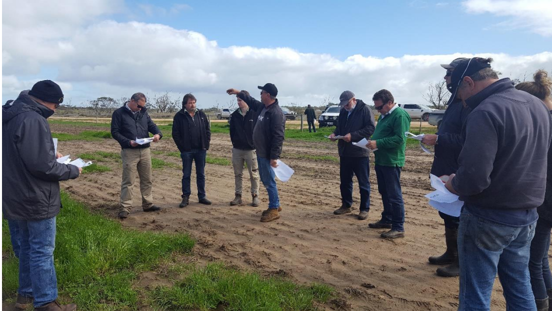
Fig3. Seednet representatives visiting the site

This issue was raised by K.Roberts (landholder) and Landmark Cookes Plains with Seednet who undertook further investigation; particularly around soil sampling areas where Messina had established vs. those where it hadn't. A delegation from Seednet came to the site in August to learn more about the activities that were being undertaken and also to discuss the poor germination across parts of the site (Fig 3).