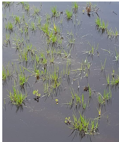
Figure 10. Messina inundated in water