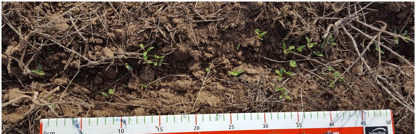
Fig 5. Initial germination at Coomandook site – photo taken in area where germination averaged 25plants/m 2 . There were at least 3 germinations of Messina observed at the site from July through to August. These germinations appeared to occur after large rainfall events. The initial germination had nodulated well, and the nodulation was effective (pink, fleshy nodes) – Fig 7.